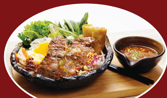
BÚN CHẢ GIÒ THÁNG ★ 19.8 BÒ ĐẶC BIỆT Bún Noodle with Premium Marbled Beef & Fried Spring Rolls

Drizzled with a lively sauce, a traditional Vietnamese vermicelli-style noodle becomes an intricately flavored dish of contrasting tastes and textures.