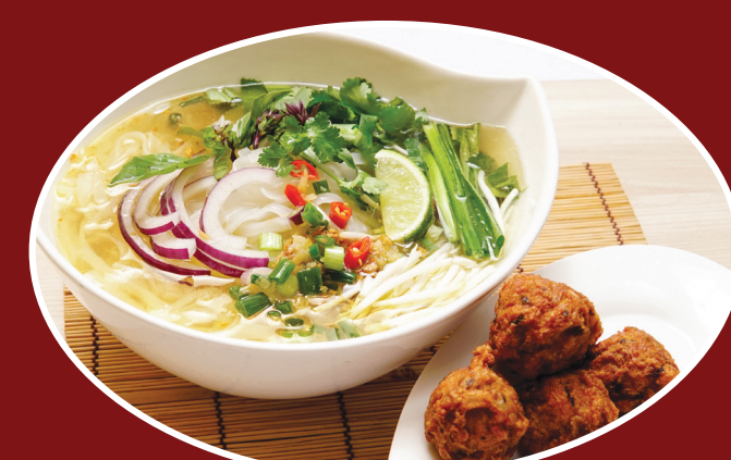
PHỞ GÀ VỚI GÀ VIÊN Pho Noodle Chicken Soup Chicken Meatballs 12.8 Chicken Chop 12.8