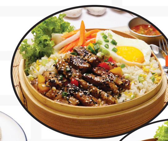
CƠM CHIÊN TRỨNG VỚI THỊT BÒ ĐẶC BIỆT ★ 19.8 Egg Fried Rice with Premium Marbled Beef