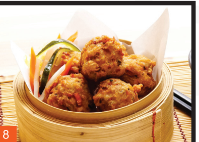
THỊT VIÊN CÚ NANG ★ 10.8 Homemade Crunchy Water Chestnut Meatballs