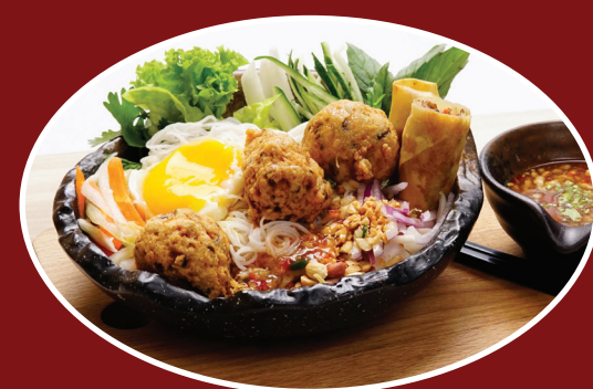
BÚN CHẢ GIÒ GÀ VIÊN 12.8 Bún Noodle with Chicken Meatballs & Fried Spring Rolls