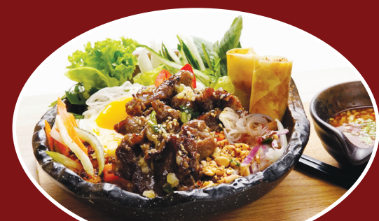
BÚN CHẢ GIÒ BÒ NƯỚNG ★ 13.8 Bún Noodle with Beef & Fried Spring Rolls