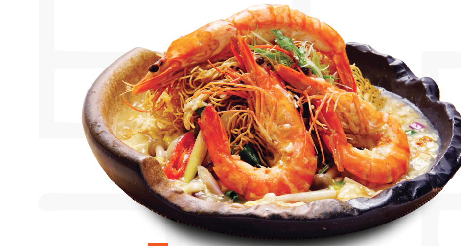
MÌ XÀO TÔM SÚ ★ 17.8 Crispy Vermicelli & Fresh King Prawns with Superior Stock Gravy

Delighting Noodle Lovers with simple, yet mouth watering Vietnamese Fried Noodles.