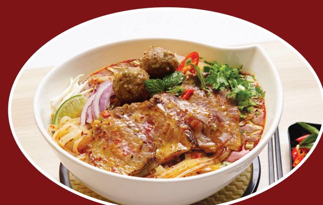
PHỞ BÒ CAY Pho Spicy Noodle Soup Marbled Sirloin Beef & Beef Balls 19.5 Sliced Beef 12.8 Beef Balls 12.8 Sliced Beef & Beef Balls 13.8 Sliced Beef, Beef Balls, Tendon & Brisket 14.8