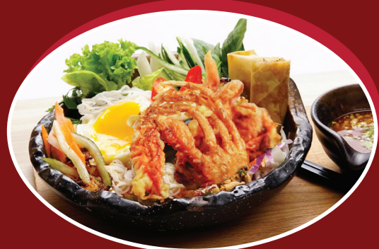
BÚN CHẢ GIÒ CUA LỘT ★ 15.5 Bún Noodle with Softshell Crab & Fried Spring Rolls