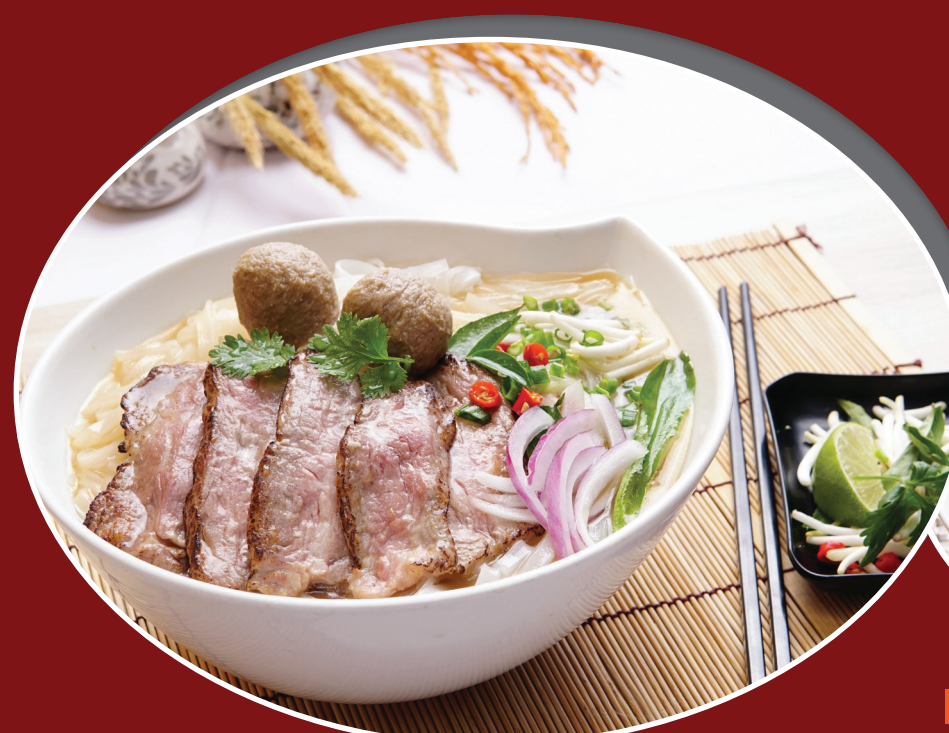
PHỞ ĐẶC BIỆT ★ 19.5 So Pho Flame Seared Premium Marbled Sirloin Beef with Beef Balls Noodle Soup

Tasty & nutritious noodle soup cooked with cinnamon star anis, ginger & wonderful healing spices.