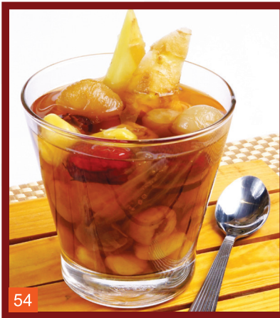
54 CHÈ NHÂN NHỤC BẠCH 5.8 QUẢ TÁO ĐỎ NÓNG Hot Longan with Red Dates & Ginger