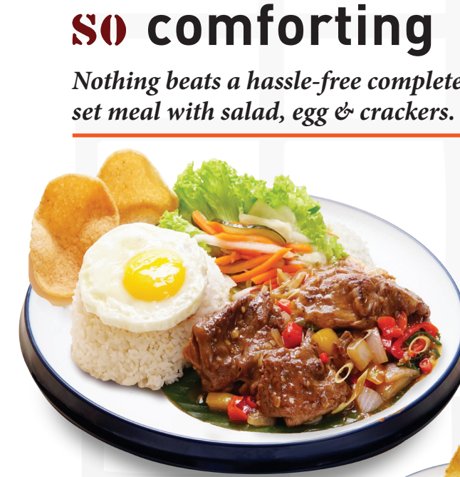
XÀO SẢ 13.8 Grilled Lemongrass Beef with Rice

Traditionally in Vietnam, Imperial Fried Rice is prepared with lotus leaf which imparts a fresh fragrance to the taste.