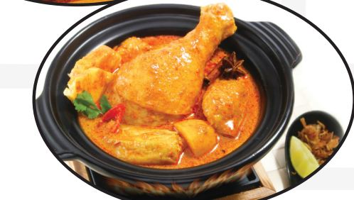
CÀ RI GÀ ★ 12.8 Vietnamese Lemongrass Curry Chicken with Bread / Rice