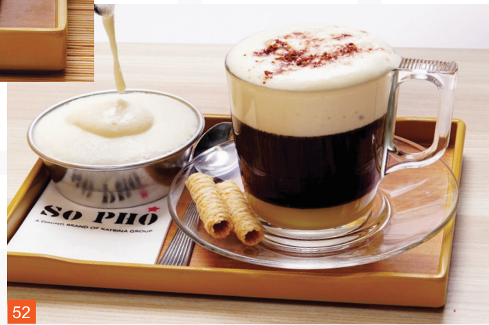
52 Vietnamese Coconut Coffee 6.8