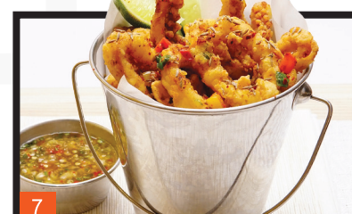
MỰC ống CHIÊN GIÒN ★ 12.8 Vietnamese Spiced Battered Squid