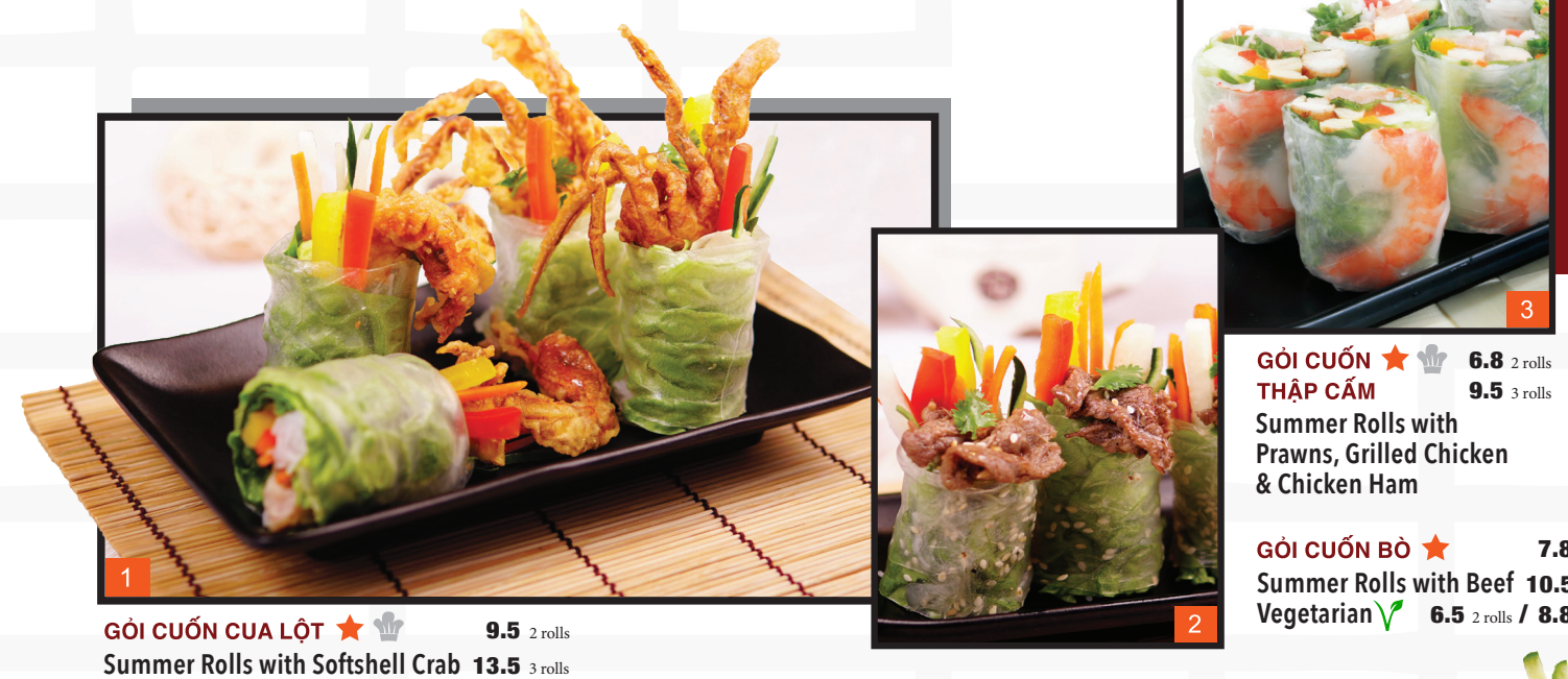
GỎI CUỐN CUA LỘT ★ 9.5 2 rolls Summer Rolls with Softshell Crab 13.5 3 rolls

Capture the essence of Vietnamese dining with a selection of delicious appetisers.