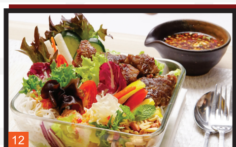
XẢ LÁCH Grilled Beef Salad 13.8 Grilled Chicken Salad 13.8 Vegetarian Salad 12.8