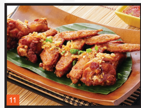
CÁNH GÀ CHIÊN SA ★ 12.5 Crispy Wings