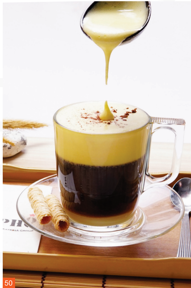
50 Vietnamese Egg Coffee 6.8