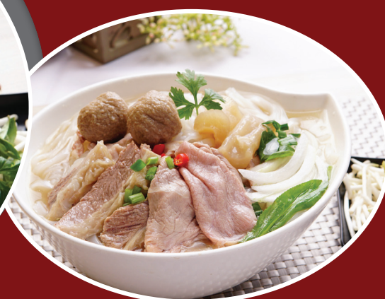
PHỞ TÁI BÒ VIÊN ★ Pho Noodle Soup Sliced Beef 12.8 Beef Balls 12.8 Sliced Beef & Beef Balls 13.8 Sliced Beef, Beef Balls, Tendon & Brisket 14.8