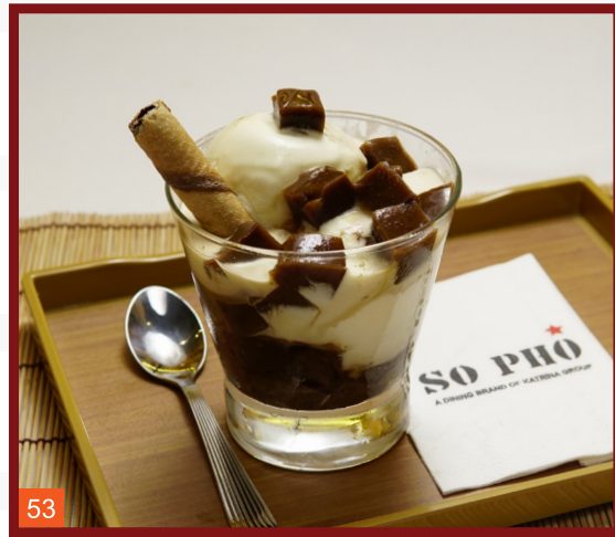
63 CÀ PHÊ RAU CÀU KEM ★ 6.8 Coffee Jelly Ice Cream

End your meal with a sweet delicacy to relieve your tingling taste buds.