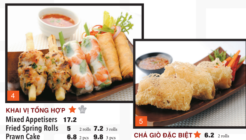
KHAI VỊ TỔNG HỢP ★ 17.2 Mixed Appetisers Fried Spring Rolls 5 2 rolls 7.2 3 rolls Prawn Cake 6.8 2 pcs 9.8 3 pcs