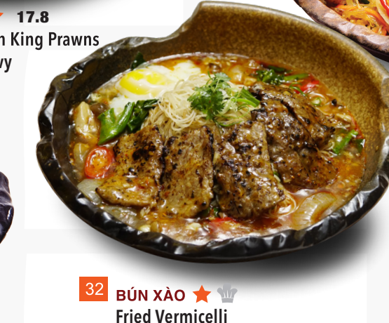
BÚN XÀO ★ Fried Vermicelli Premium Marbled Beef 19.8 Beef / Chicken 14.8 Vegetarian 13.5

Traditionally in Vietnam, Imperial Fried Rice is prepared with lotus leaf which imparts a fresh fragrance to the taste.