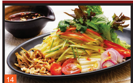
GỎI XOÀI ĐU ĐỦ ★ Mango & Papaya Salad with Anchovies 9.8 Vegetarian 8.8