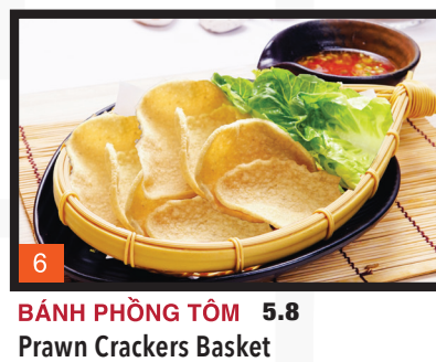
BÁNH PHỒNG TÔM 5.8 Prawn Crackers Basket