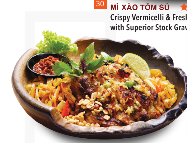
PHỞ XÀO ★ Fried Pho Noodle King Prawns 17.8 Beef / Chicken 14.5 Vegetarian 12.8