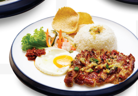
NƯỚNG SẢ 13.8 Grilled Lemongrass Chicken with Rice