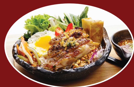
BÚN CHẢ GIÒ GÀ NƯỚNG 13.8 Bún Noodle with Grilled Lemongrass Chicken & Fried Spring Rolls Vegetarian with Sautéed Tofu 11.8

★ Popular 🍌 Chef Recommendation 🌿 Vegetarian