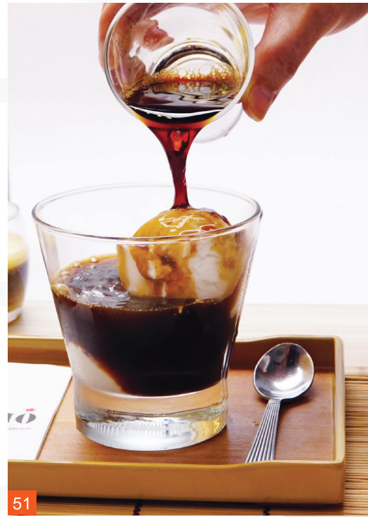
51 Vietnamese Affogato 7.8 Expresso with Ice Cream 2 scoops