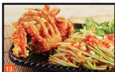
GỎI XOÀI ĐU ĐỦ VỚI CUA LỘT 14.8 Mango & Papaya Salad with Softshell Crab