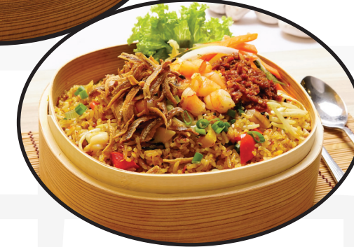
CƠM CHIÊN ★ Vietnamese Fried Rice Seafood / Beef / Chicken 13.8 Vegetarian 12.8