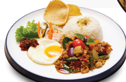
XÀO HÚNG QUẾ ★ Stir-fried Basil with Rice Beef 12.8 Chicken 12.8 Vegetarian 10.8