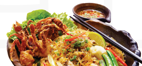
MIẾN XÀO CUA LỘT ★ Fried Glass Noodle Softshell Crab 15.8 Beef / Chicken 13.8