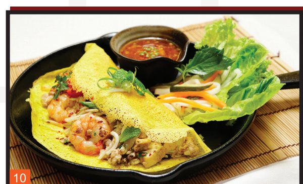
BÁNH XÈO ★ Vietnamese Pancake with Minced Chicken & Seafood 13.8 Vietnamese Vegetarian Pancake 12.8