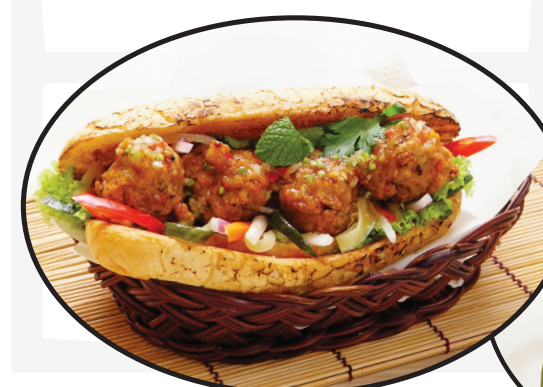
BÁNH MÌ ★ Baguette Beef / Chicken 8.8 Chicken Meatballs 8.8 Vegetarian 7.8

Looking for a quick bite? Grab a refreshing and extraordinary Vietnamese Baguette.