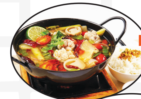
LÀU ★ 17.5 Hotpot Chicken / Beef with Rice / Vermicelli

Stay prepared for a Hearty & Satisfying Hotpot.